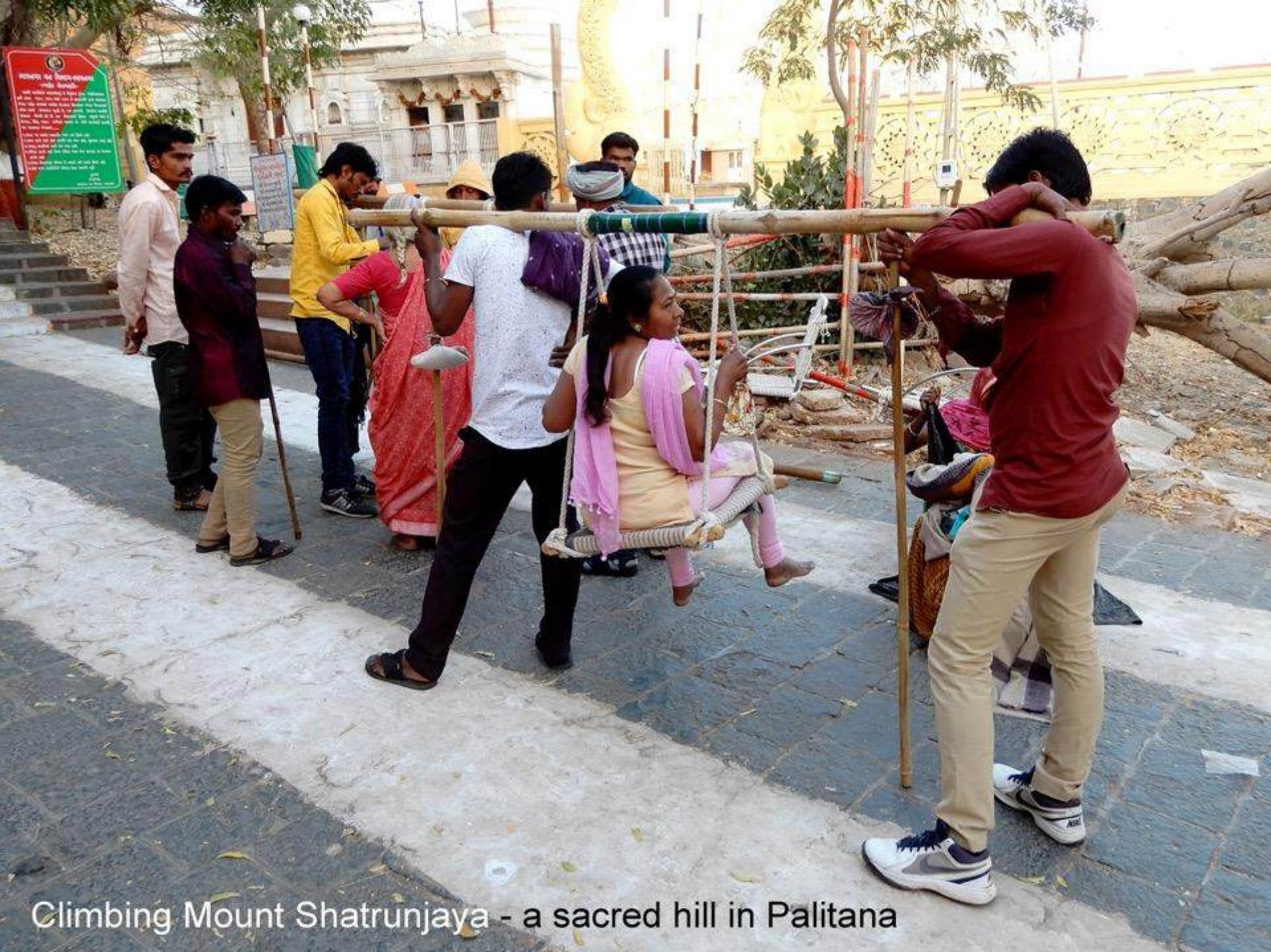
Climbing Mount Shatrunjaya - a sacred hill in Palitana