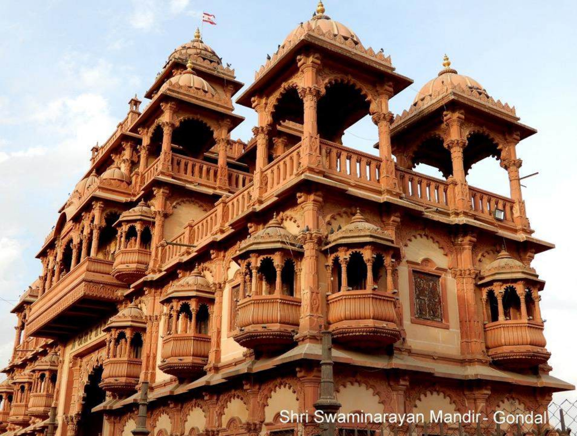
Shri Swaminarayan Mandir - Gondal