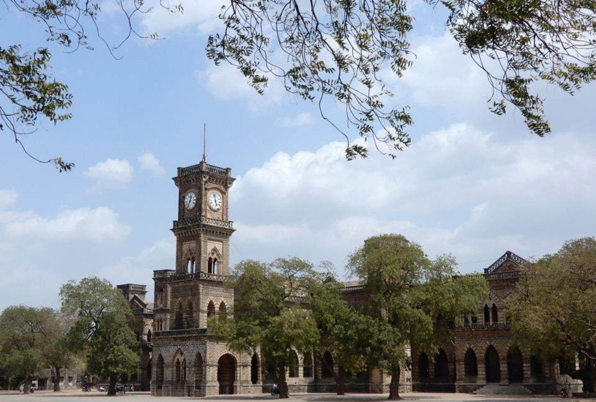
Sangram Singhji High School, 1887