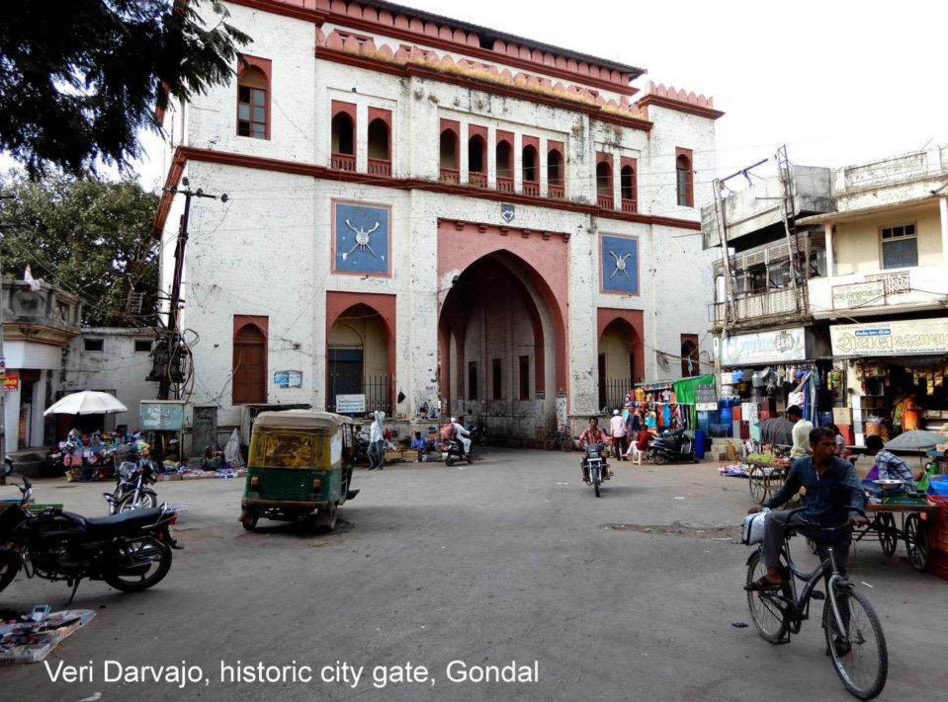
Veri Darvajo, historic city gate, Gondal