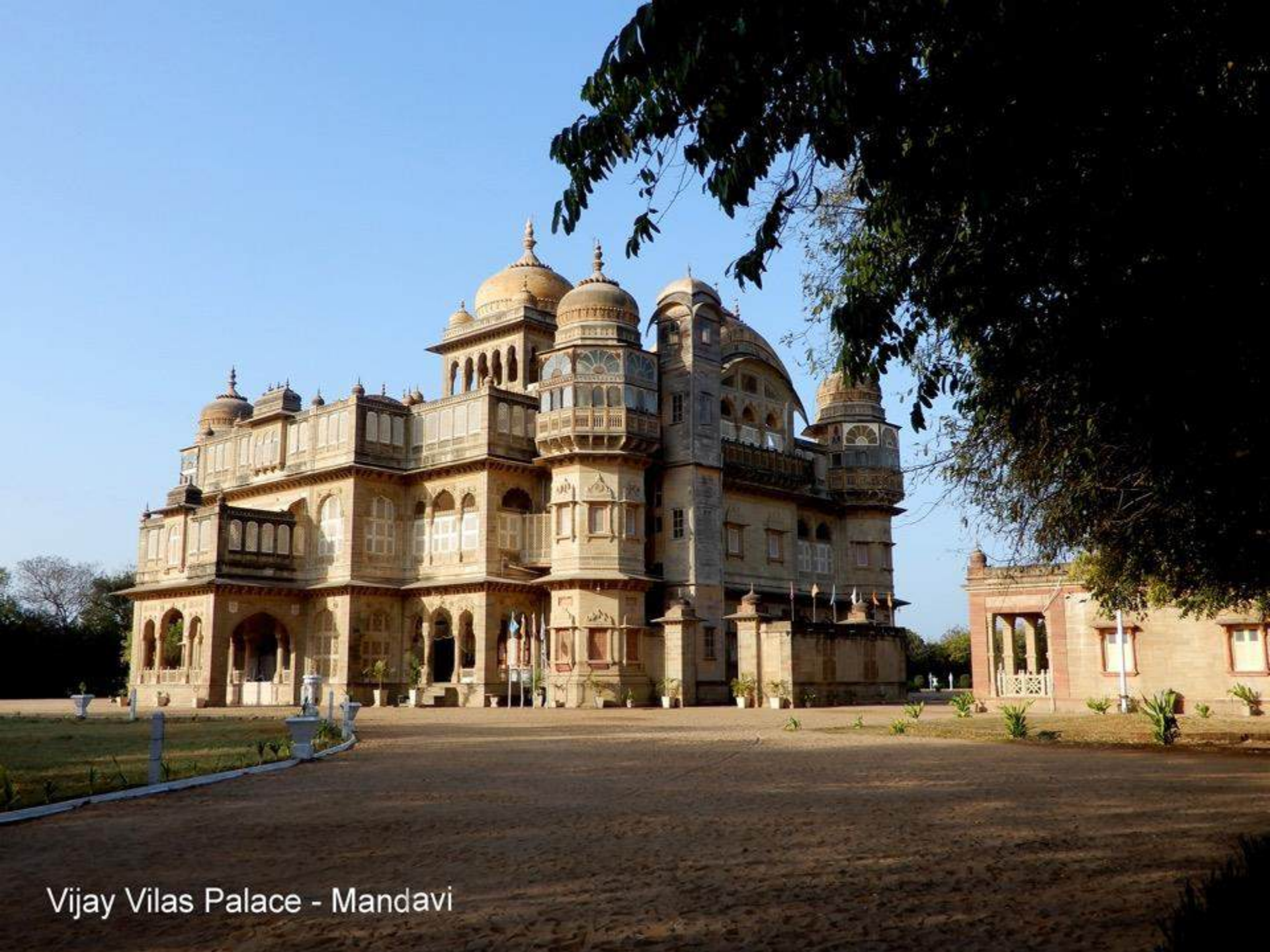
Vijay Vilas Palace - Mandavi