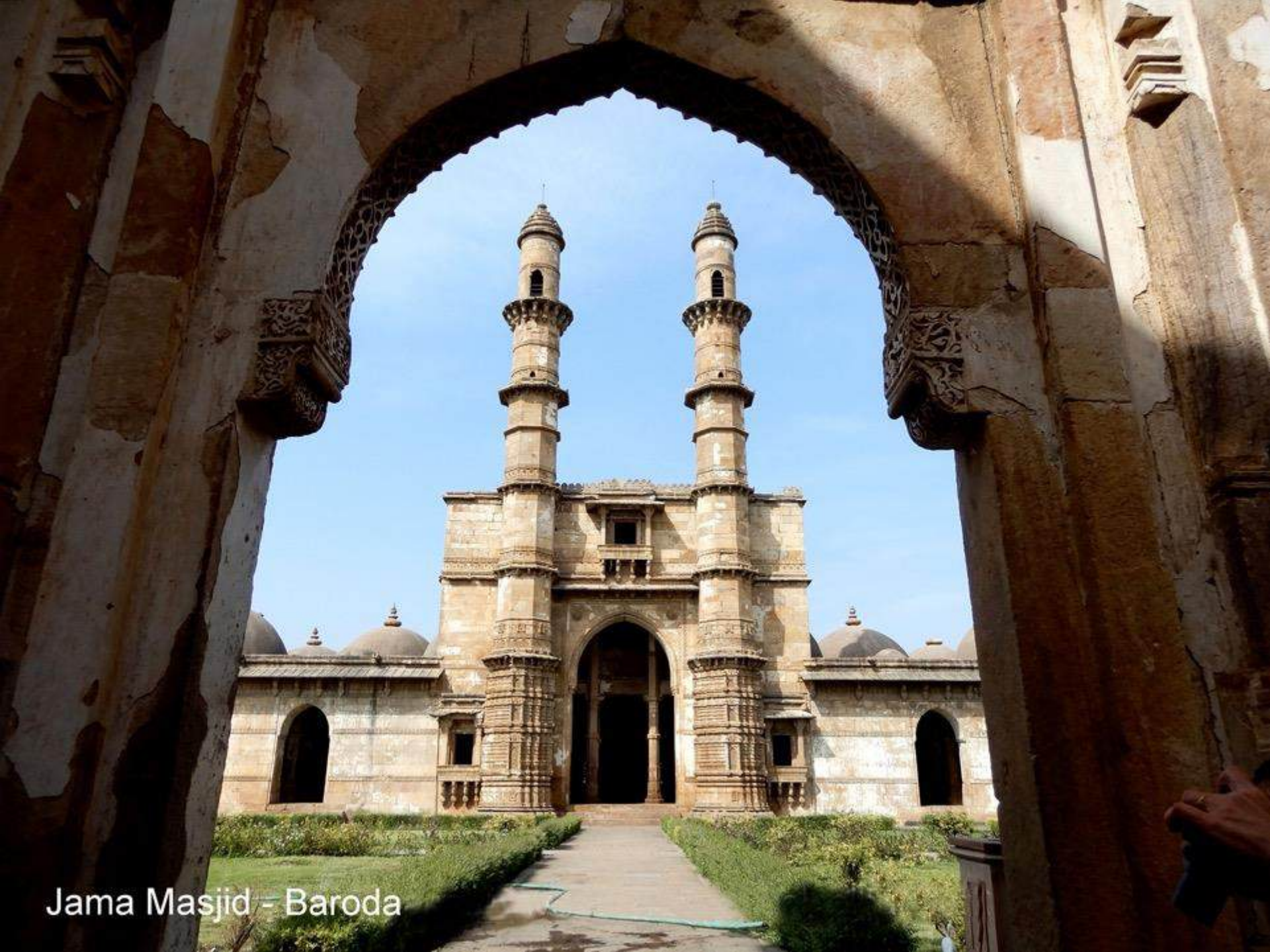
Jama Masjid - Baroda