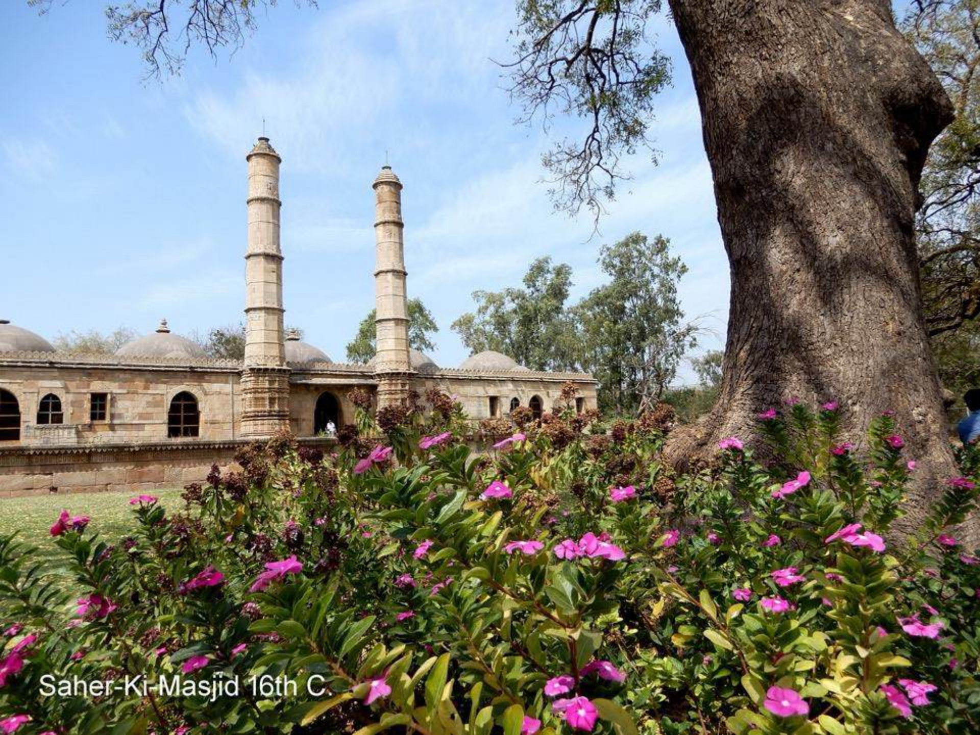
Saher-Ki-Masjid 16th C.