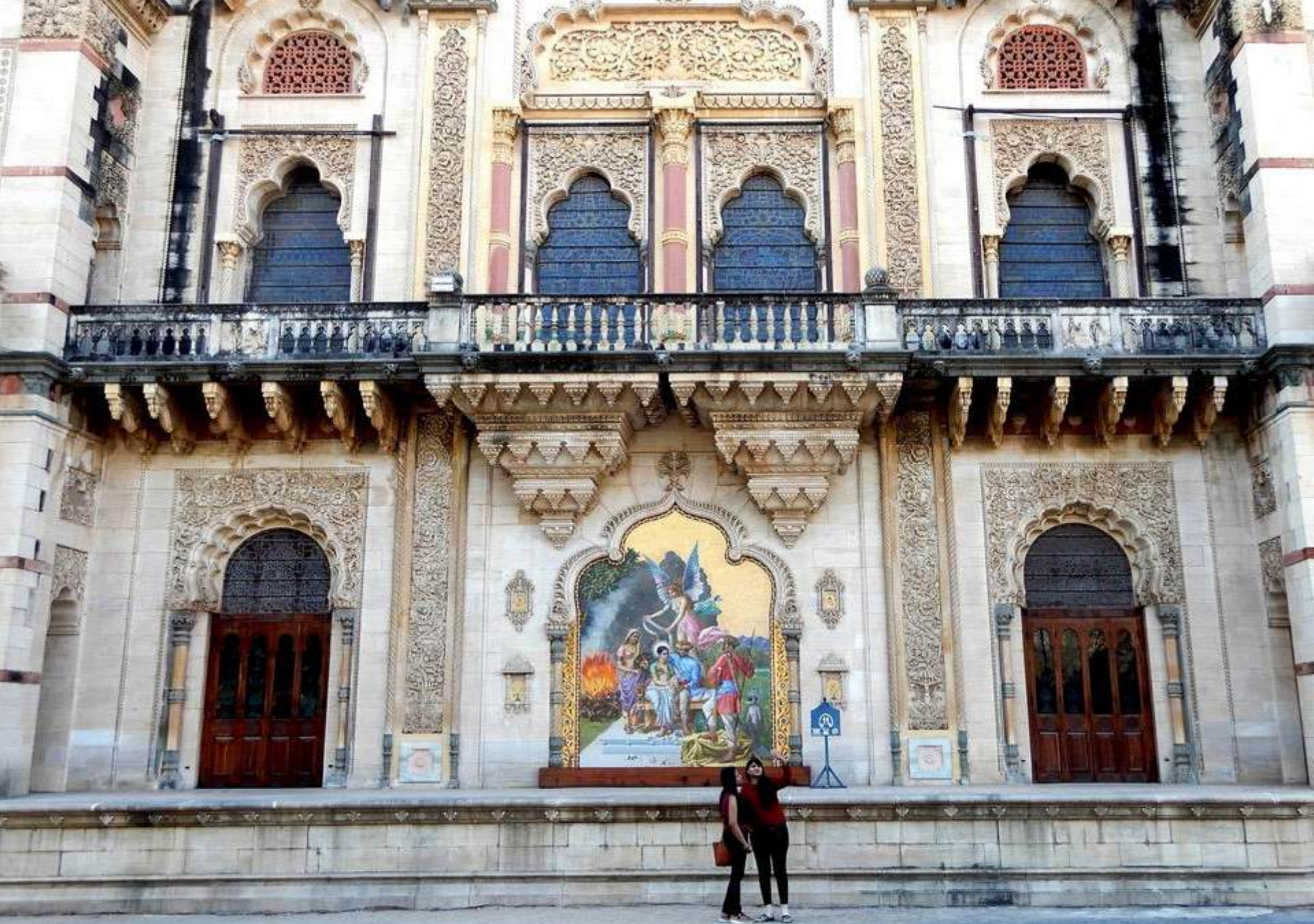
Maharaja Fateh Singh Museum