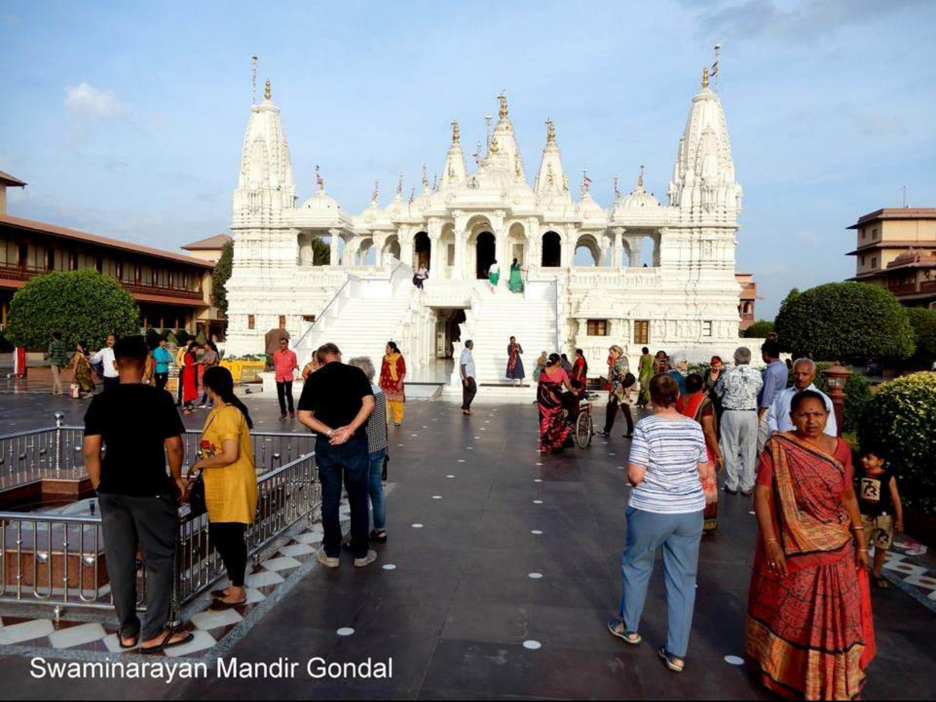
Swaminarayan Mandir Gondal