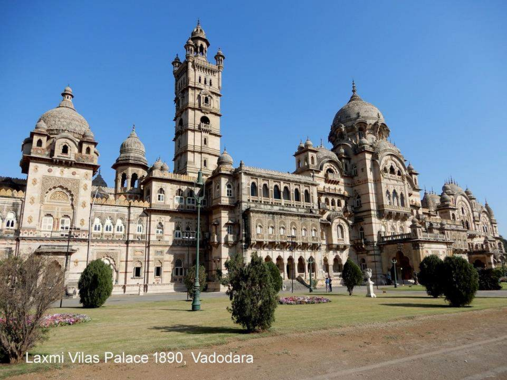
Laxmi Vilas Palace 1890, Vadodara